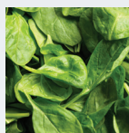
WEDNESDAY Saag Paneer