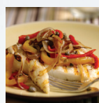
FRIDAY Grilled Halibut with Red Pepper Salad