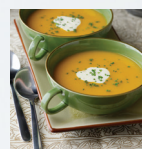
THURSDAY Squash Soup with Ginger Cream