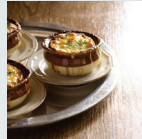
MONDAY French Onion Soup