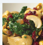
FRIDAY Kale, Cashew, and Cranberry Pasta Salad