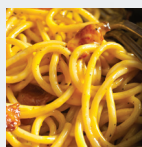
WEDNESDAY Bucatini alla Carbonara