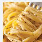
THURSDAY Spaghetti Cacio e Pepe