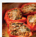
FRIDAY Sausage and Barley-Stuffed Peppers