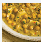
FRIDAY Pasta e Ceci