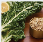
WEDNESDAY Green Lentils with Swiss Chard and Lemons