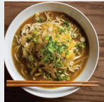
TUESDAY Curry Udon Noodles