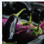
FRIDAY Pasta alla Norma