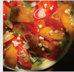
MONDAY Tomato and Corn Salad with Grilled Shrimp