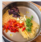
WEDNESDAY One-Pot Mediterranean Pasta