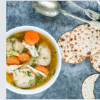
MONDAY Matzo Ball Soup