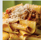
MONDAY Rigatoni Bolognese