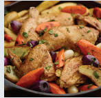
MONDAY Roasted Chicken with Chimichurri Sauce