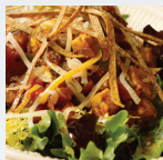
WEDNESDAY Tempeh Taco Salad