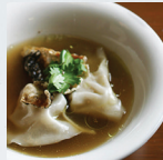
TUESDAY Wonton Soup