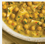
FRIDAY Pasta e Ceci