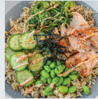
MONDAY Poke-Style Roasted Salmon Bowls