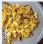
WEDNESDAY Matzo Brei