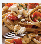
FRIDAY Tomato, Chicken, and Feta with Whole Wheat Fettuccine