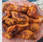
MONDAY Honey-Sriracha Wings with Garlic Cheese Grits