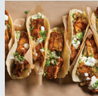
MONDAY Grilled Fish Tacos