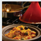
TUESDAY Chicken Tagine