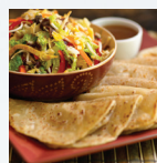
FRIDAY Moo Shu Vegetables