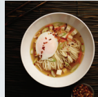
MONDAY Asian Noodle Soup