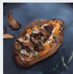
WEDNESDAY Baked Sweet Potatoes with Caramelized Onions