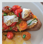
MONDAY Cod and Burst Tomato Toast