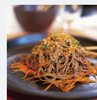
THURSDAY Soba Noodle Salad