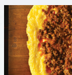
FRIDAY Polenta with Sausage Sauce