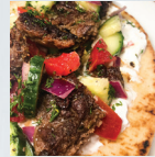
MONDAY Crispy Lamb Pita