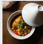
TUESDAY Chicken Thighs with Olives