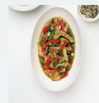
THURSDAY Thai Green Curry with Pork and Vegetables