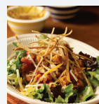
FRIDAY Taco Salad with Chicken