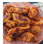
THURSDAY Honey Sriracha Chicken Wings with Mango Coleslaw