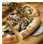
TUESDAY Roasted Vegetable Pizza