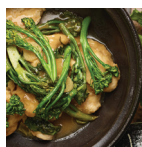
WEDNESDAY Take Out-Style Chicken and Broccoli