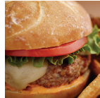
MONDAY Turkey Burgers