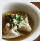
TUESDAY Wonton Soup