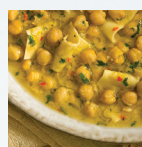
FRIDAY Pasta e Ceci