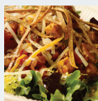
WEDNESDAY Tempeh Taco Salad