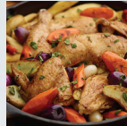
MONDAY Roasted Chicken with Chimichurri Sauce