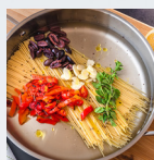
WEDNESDAY One-Pot Mediterranean Pasta