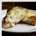
MONDAY Croque Monsieur