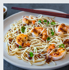
TUESDAY Chile-Garlic Noodles with Shrimp