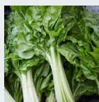
WEDNESDAY Creamed Swiss Chard with Prosciutto