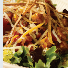
MONDAY Tempeh Taco Salad