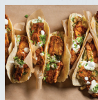
MONDAY Grilled Fish Tacos