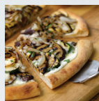
TUESDAY Roasted Vegetable Pizza