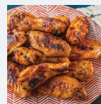
THURSDAY Honey Sriracha Chicken Wings with Mango Coleslaw