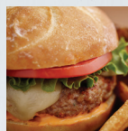
MONDAY Turkey Burgers