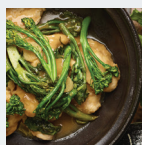
WEDNESDAY Take Out-Style Chicken and Broccoli