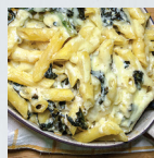
MONDAY Lemon Baked Pasta with Broccoli Rabe