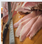
WEDNESDAY Corned Beef with Winter Vegetables