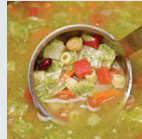
MONDAY Minestrone Soup