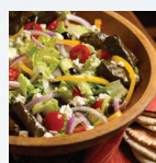
FRIDAY Greek Salad