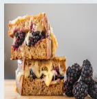
TUESDAY Fontina and Blackberry Grilled Cheese Sandwiches