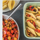
MONDAY Eggplant Caponata Stuffed Shells