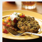
WEDNESDAY Black Bean Cakes with Tomato Salsa