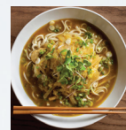
THURSDAY Curry Udon Noodles