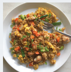
WEDNESDAY Shrimp Fried Rice