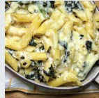
MONDAY Lemon Baked Pasta with Broccoli Rabe