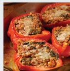
TUESDAY Sausage and Barley Stuffed Peppers