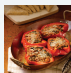
FRIDAY Sausage and Barley-Stuffed Peppers