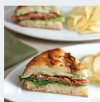
WEDNESDAY Grilled Focaccia Sandwich with Bacon and Avocado