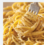
THURSDAY Spaghetti Cacio e Pepe